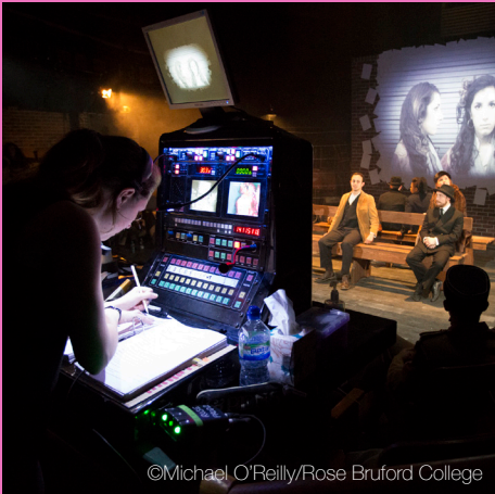
Bexley The first and largest theatre-making centre dedicated to national touring companies.