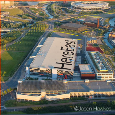
1.2 million square foot campus.

Here East is a dedicated place for individuals and companies who pioneer technology to share expertise and create the products of tomorrow. Offering unrivalled space, connectivity and collaboration, it will be complimented by the Plexal innovation centre in June 2017 with a suite of services to accelerate growth and empower businesses. Here East is Phase 1 of a world-class Cultural and Education District that will showcase exceptional art, dance, craft, technology and design.