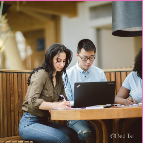
Colchester University of Essex Knowledge Gateway , home of digital and gaming.