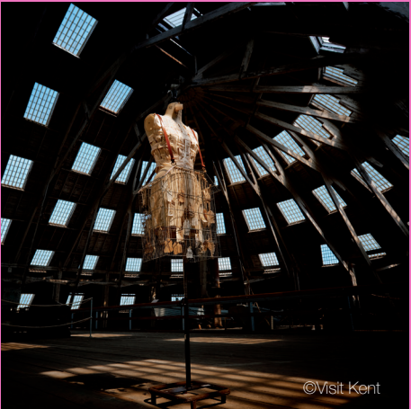
Kent Creative-lab A new industrial research laboratory for prototyping, skills development and production across multiple creative disciplines.