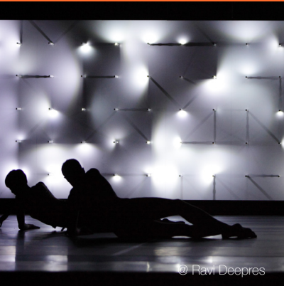
Home to Studio Wayne McGregor, offering a world-class arts space for professional artists and learning programmes.