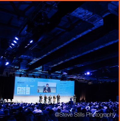
The 950-seat auditorium and cultural event space is available to Here East and the local community.