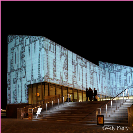
Margate A creative and digital hub at Turner Contemporary will offer digital knowledge sharing, skills, training and studios.