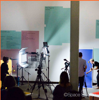
Tenants already include BT Sport, Loughborough University, UCL and Signal Noise.