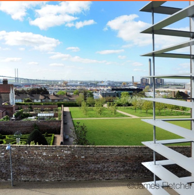
14 acre creative production park occupied by multiple partners

High House Production Park is a collaboration between Royal Opera House, National College Creative Industries, Acme Studios, Thurrock Council and Arts Council England. It was established as an international centre of excellence for the Creative Industries. The Park provides large-scale creative workshops, which are in short supply in the region, and state-of-the-art studios. The centre also offers professional skills training, qualifications and routes into employment for the next generation.