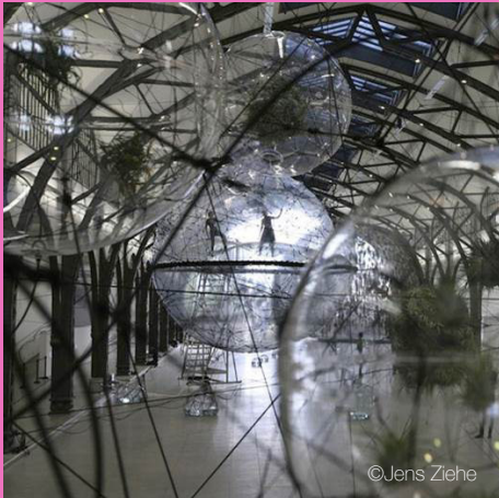
Silvertown A new art foundry for manufacturing large scale artworks and sculptures, including the biggest 3D printing centre in the country.