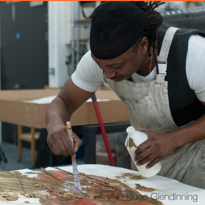
The Bob and Tamar Manoukian Production Workshop, home to the Royal Opera House's set building facility