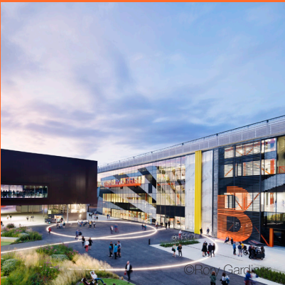
Education institutions and creative organisations work together with established businesses to share expertise with start-ups.