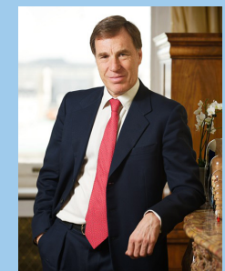
Sadiq Khan Mayor of London

A handwritten signature of Christian Brodie in black ink.