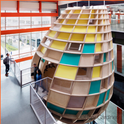
Innovation accelerators in sport, health, fashion, Smart Cities and the Internet of Things