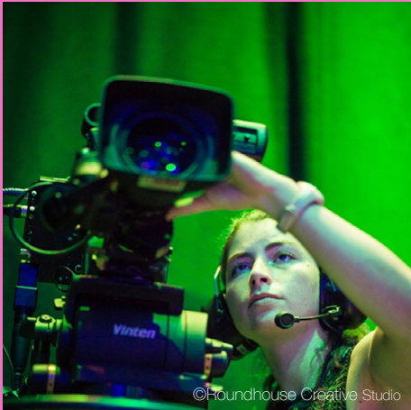
Dagenham London's largest film studio for 25 years will create space for increased major feature film production.

Since 2010, a number of multi-million pound iconic projects have already been realised across the region. Others are in the pipeline or being imagined, part of a strategy that will take us to 2050. Strategic investment is needed to create centres with the space to manufacture large-scale products – so that our stage industry can remain technically competitive, our growing East London fashion cluster can meet its potential and so we can make more feature films. The following ideas identify major innovation hubs that could create a unique creative Production Corridor.