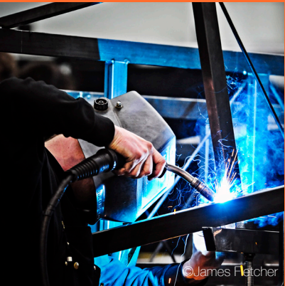
Employing 150 people in creative production