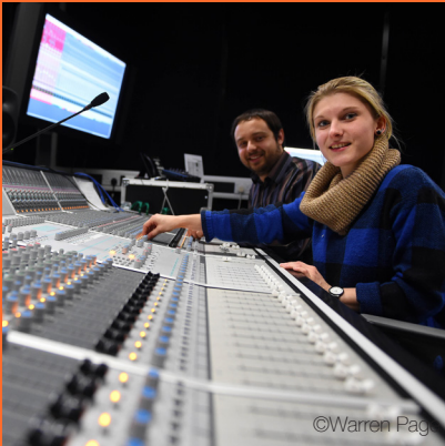
The National College Creative Industries, including the Backstage Centre