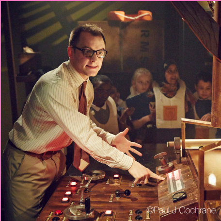
Woolwich A new national hub for experiential arts will enable the South East to capitalise on being a global centre for immersive performance.