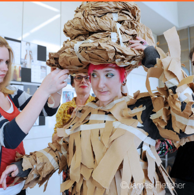
ACME's 43 artists' studios