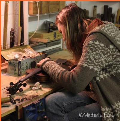
Centre for technical training including a focus on apprenticeships for the creative industries