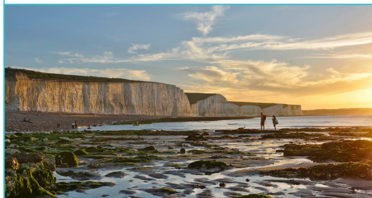
Birling Gap, East Sussex