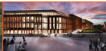
CCCU building design