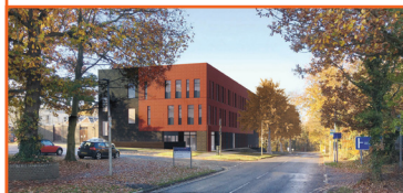
University of Kent building design