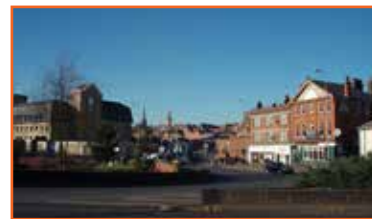
Colchester, Essex

Seven towns in the South East LEP area have been given the chance to bid for up to £25m each from the £3.6bn Towns Fund pot. Colchester, Grays, Harlow, Hastings, Margate, Newhaven and Tilbury have been named in the list of 101