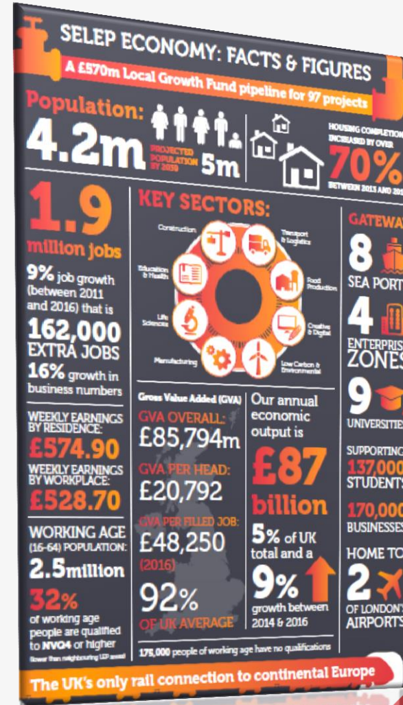
THE UK'S ONLY RAIL CONNECTION TO CONTINENTAL EUROPE