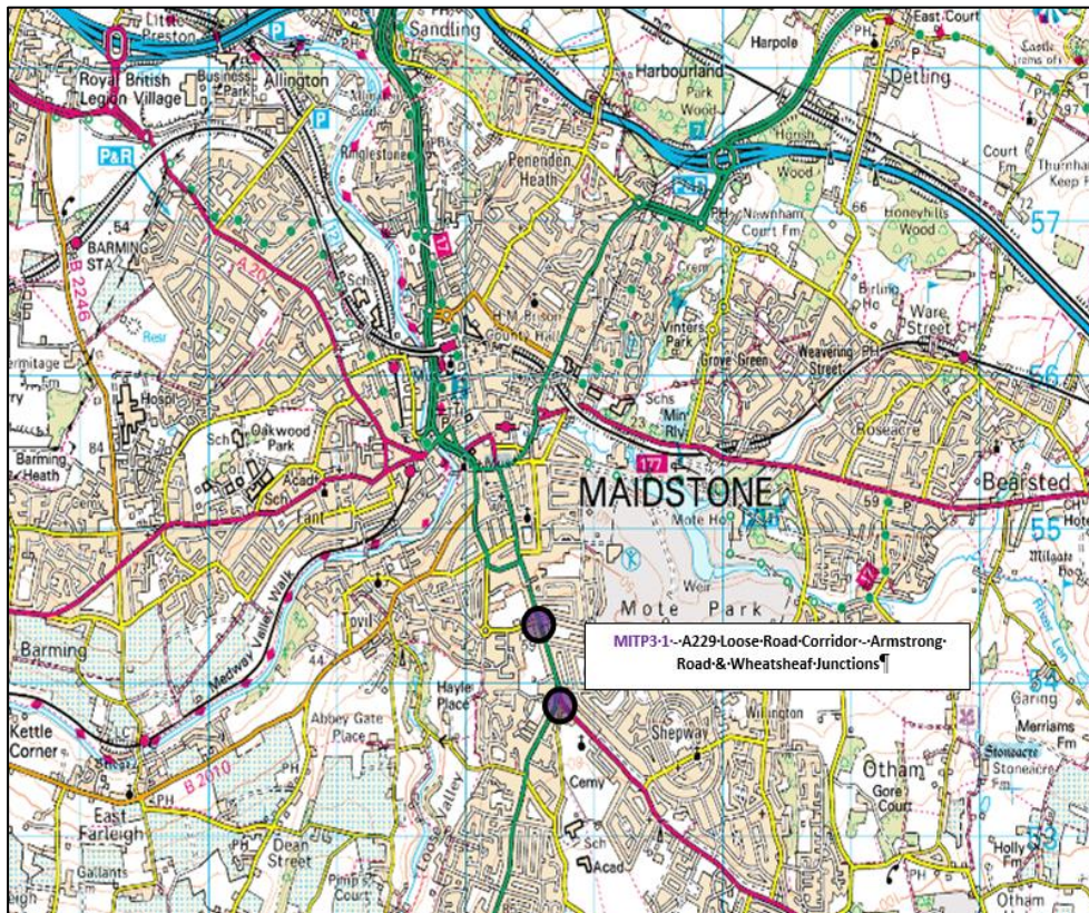
Figure 1 – Loose Road Corridor schemes

9.4. Options to improve traffic along the A229 Loose Road corridor were explored through a feasibility study of the A229 Loose Road corridor. Following a number of options having been explored, the following two interventions were identified as the preferred options: