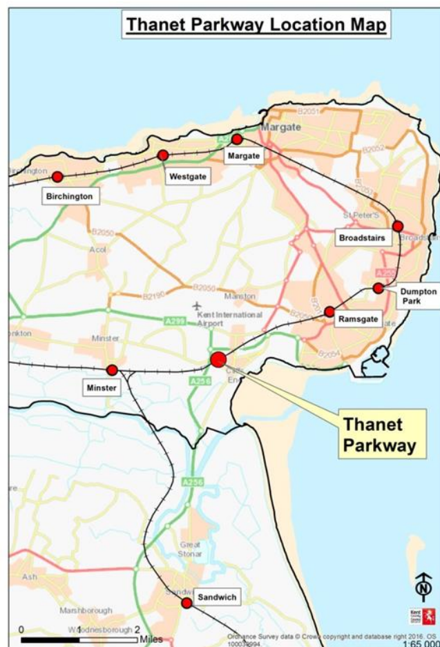
Figure 1 – Thanet Parkway Station Location