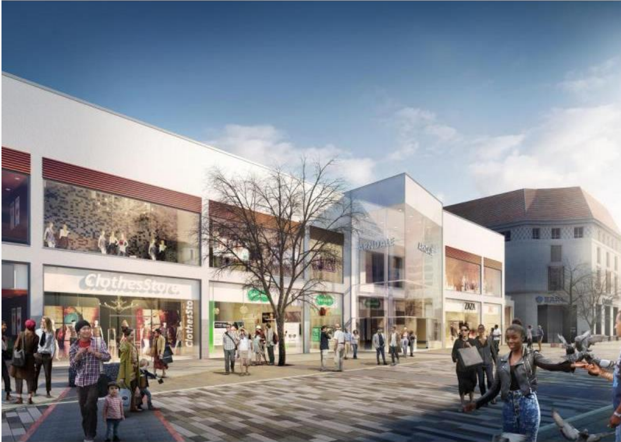
Eastbourne Town Centre £8m LGF allocation